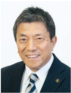
Mayor of Ichinoseki City Yoshihito Sato